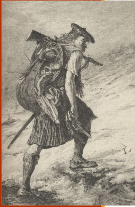
A drawing of Edward Waverley from Sir Walter Scott's novel

“Scott introduces us to his knowledge and learning of this period in Scottish history through Edward's character”